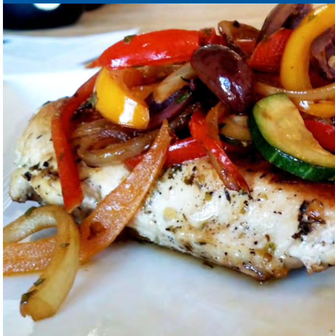
Plate chicken and top with vegetable mixture.

Remove from heat and stir in Kalamata olives.