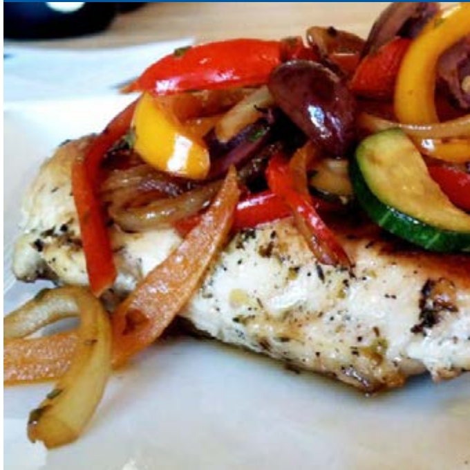
Plate chicken and top with vegetable mixture.

Remove from heat and stir in Kalamata olives.